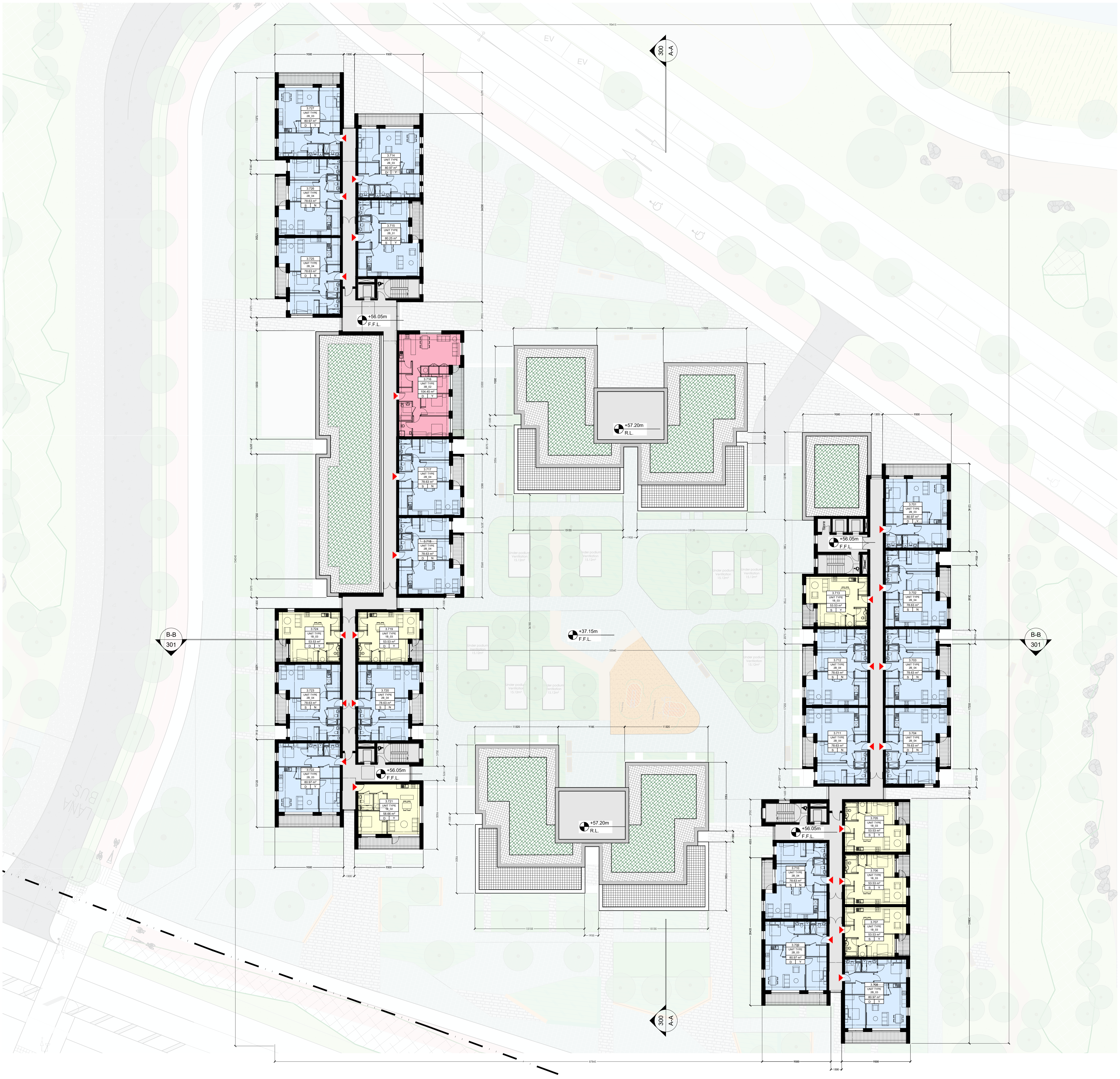
7th Floor Plan - Block 3 Scale 1:200 @A0